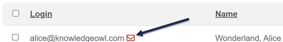
Sample email delivery issue icon in the reader list

Any readers with email issues will also display a red envelope next to their name in the Readers page: